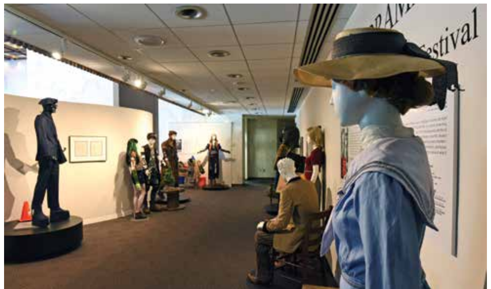
A view of the exhibition at the Culture Center in September 2019.

I watched my mother design scenery and costumes and just felt like it was inherent in the way I thought. I participated in "behind the scenes" work and on-stage as an actor