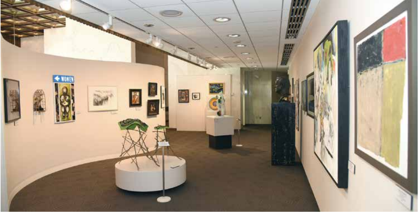
One section of the West Virginia Juried Exhibition display at the Culture Center.