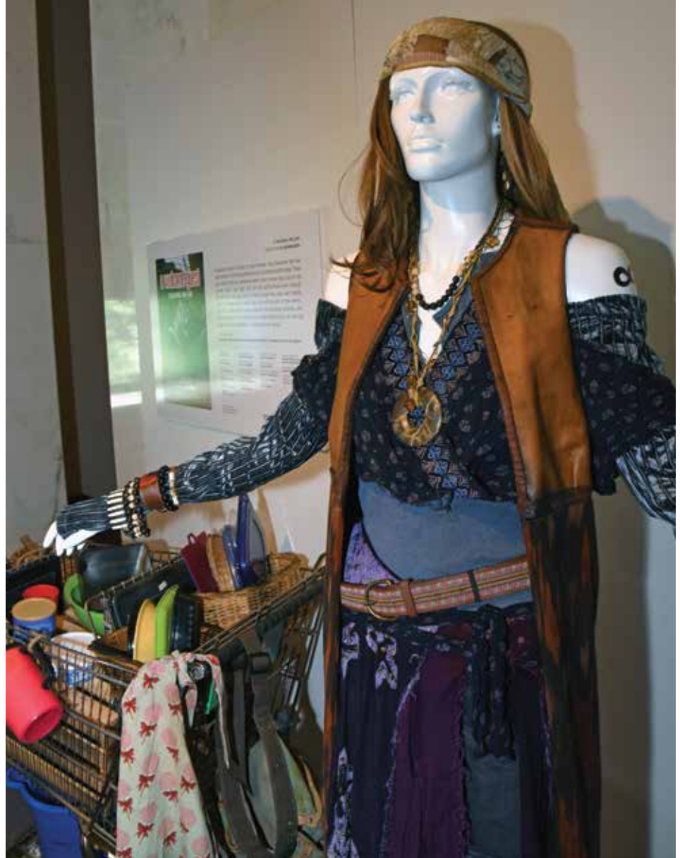
A close up of a costume from A Welcome Guest: A Psychotic Fairy Tale .

Yes! Honestly it did. I wondered if people would really look at the work of a costume designer and consider it ‘art’. So, I must say I was very honored and humbled that I was considered an artist by folks outside of the theater.