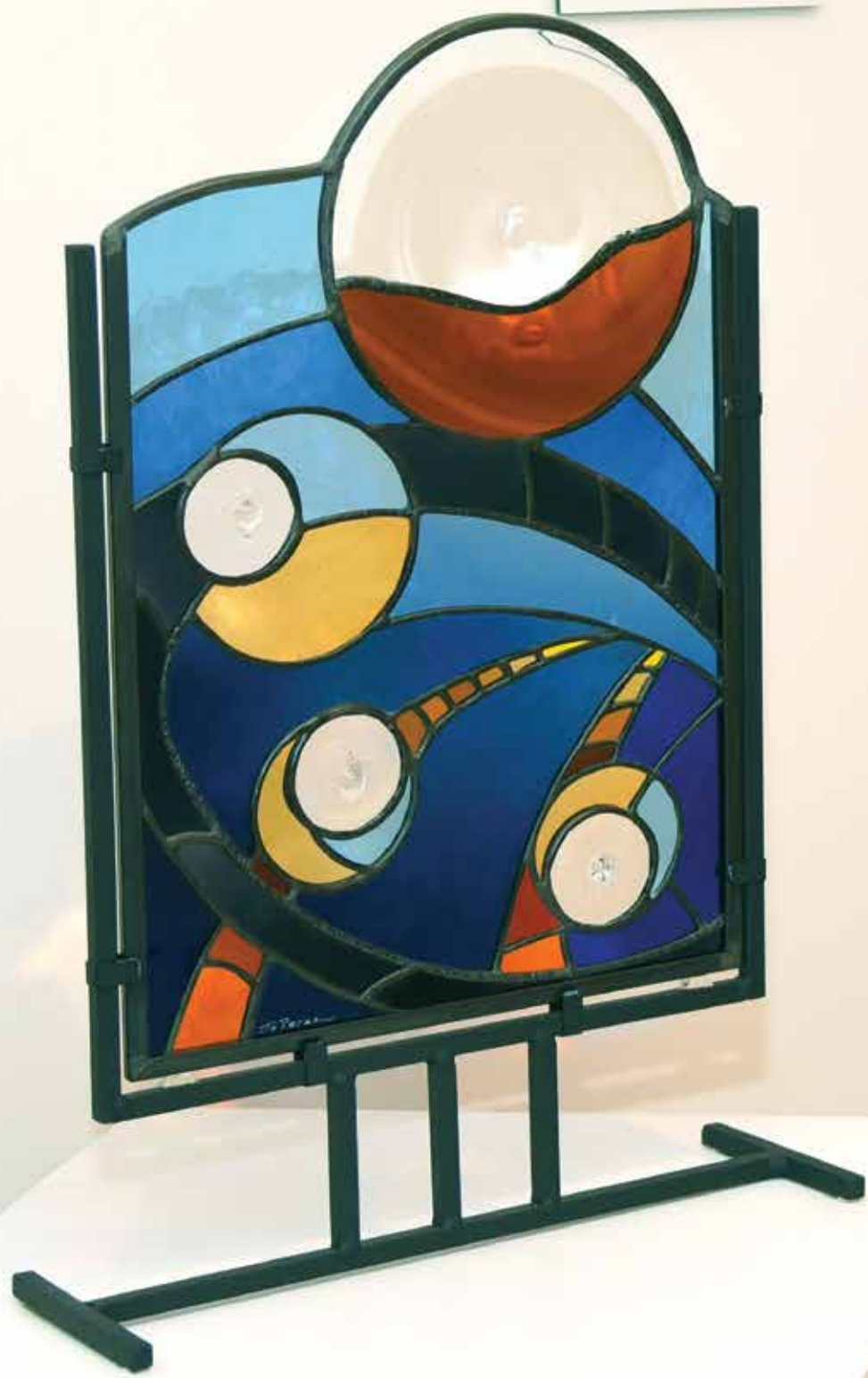
In Peere Alderson, Monroe County Four Moons Ago Stained glass, copper foil solder, metal $1200