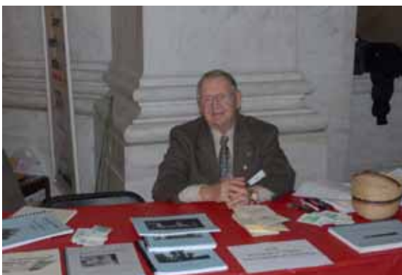
Kanawha Valley Genealogical Society table