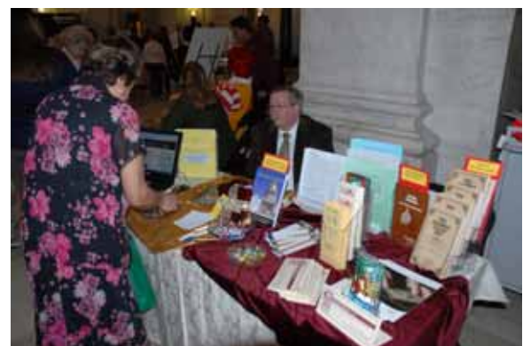
West Virginia Archives and History Library table