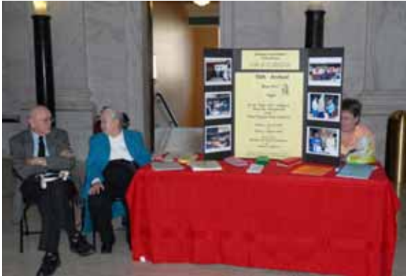
Mining Your History Foundation table