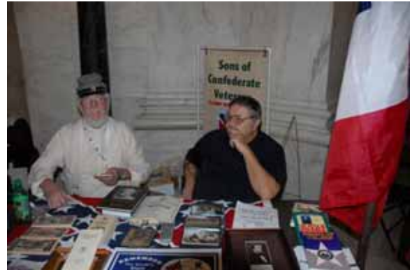
Robert S. Garnett Camp, Sons of Confederate Veterans