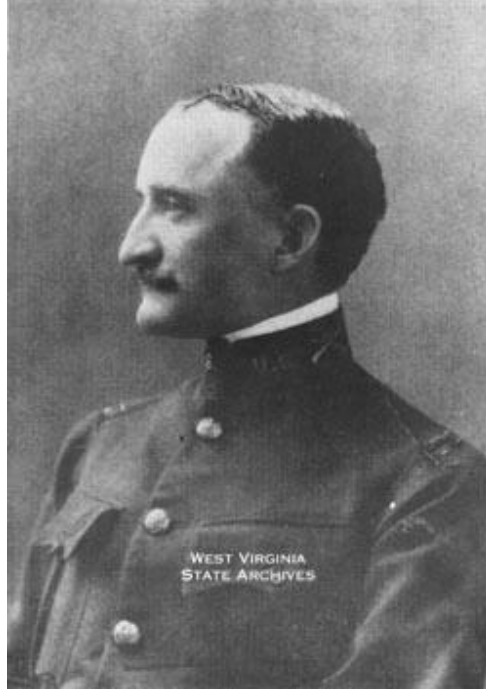
A Message to Garcia, 1917