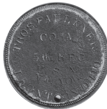
Figure 1. Civil War Identification Disc of Thomas Faulkner.