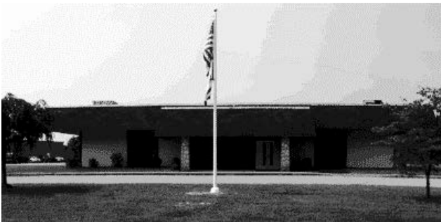
Professional Development Center classroom building; formerly the Shawnee Hills Regional Center

Between July 1974 and May 2002, the Shawnee Hills Regional Center operated on a 32-acre tract of land adjacent to the academy’s eastern boundary. The facility provided services to mentally challenged and handicapped children and adults. When the center went bankrupt, the department offered to purchase 32 acres and existing buildings for $1.05 million. But the Kanawha County commissioners immediately insisted that they should receive $660,000 of the sale price. Their claim was based on the fact that they had donated the land in 1968 on condition that it be used to help the mentally ill. If it were used for any other use, the land would revert to county control. The department stated that it needed