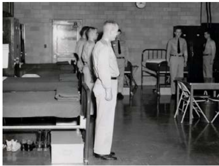
Left: Dormitory inspection

by it is hoped that training programs of this nature can be expanded and increased.” 17