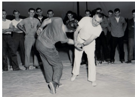
Unarmed combat (jiu-jitsu) instruction

The conservation commission and the liquor control commission again used academy facilities to train their enforcement personnel. The DPS accommodated by supplying instructors. 18