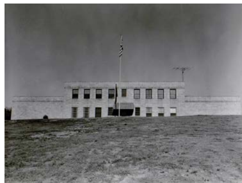
Original academy structure, A Building, immediately after construction in 1949; designated Charles W. Ray Building in 1977