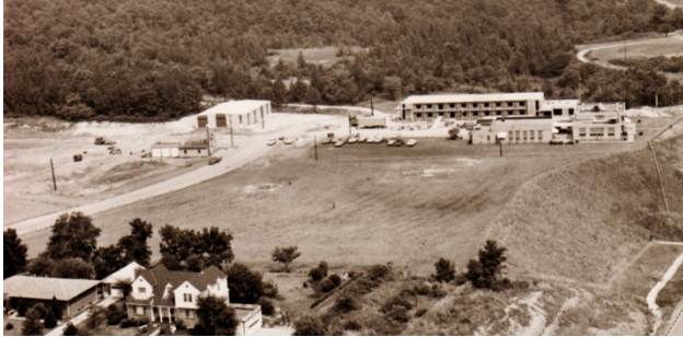
Dormitory building under construction, circa 1969

of the most modern dormitory facilities of police academies in the country. It is a well-built, extremely serviceable type of building; built specifically to suit our needs and designed according to our request. It has proved to be very satisfactory.” 31