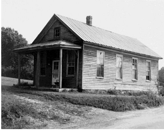
A school for African American children at Locust Knob in Hedgesville.