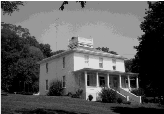
The Ross home in Hedgesville is today part of a National Register historic district.